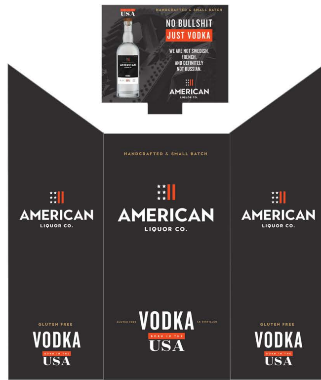
FLAT VIEW 3 SIDES