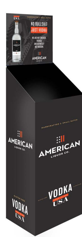
3/4 FRONT VIEW