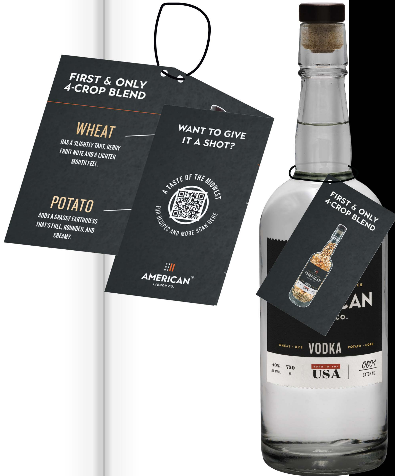
A. 4-crop necker