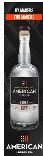
wide skyscraper 160x60