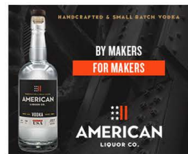
medium rectangle 300x250