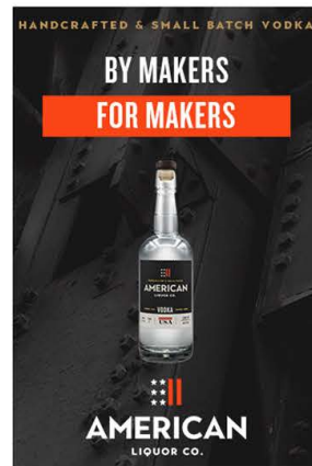
mobile full screen interstitial 320x480